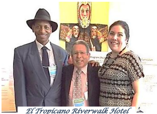
El Tropicano Riverwalk Hotel