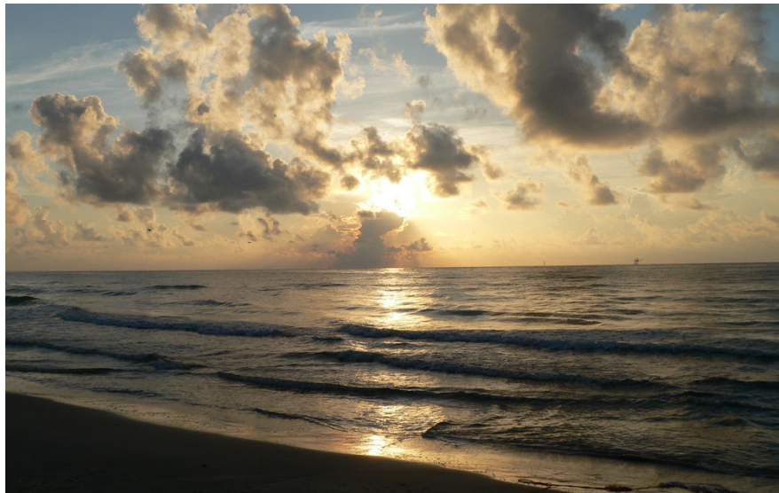
Sunrise over the beach. Corpus Christi, TX